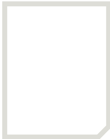
Finding that a distant relative was presented to King Charles II can be fascinating and exciting

Often there is the hope that one is related to people of high status or wealth, or perhaps someone famous or notorious. This may be a question of reflecting in another's glory to make up for one's own perceived failings. Feast and Philpot (2003) found that 60 per cent of their adoptee searchers 'felt that the result of the search would make them happier' (p.28). Another possible function of the search for adoptees is to 'to achieve a genuine