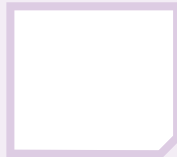
People losing homes to repossession have a different story to those fleeing domestic abuse

The question of what causes homelessness in the first place has political undertones – does the blame lie with poverty and the lack of social housing or does it sit with individuals, their histories, the choices they've made? It's also an extremely difficult question to research – the itinerant